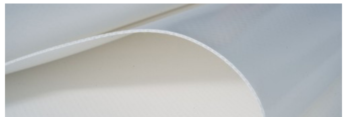
9922 WHITE – FLUO 2 MAX TYPE 2