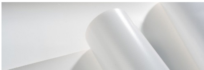
9922 WHITE – FLUO 2 MAX TYPE 1